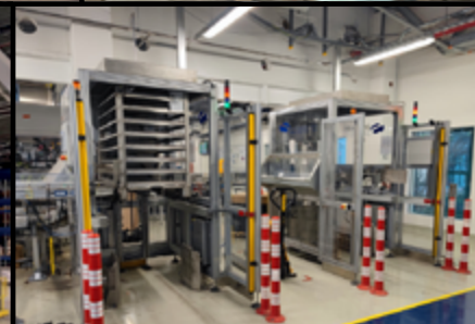
SIMPLIMATIC Automation Puck Magazine Loaders/Unloaders