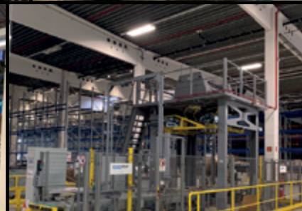
BEUMERGROUP Stretch Pallet Wrapping/Palletizing System