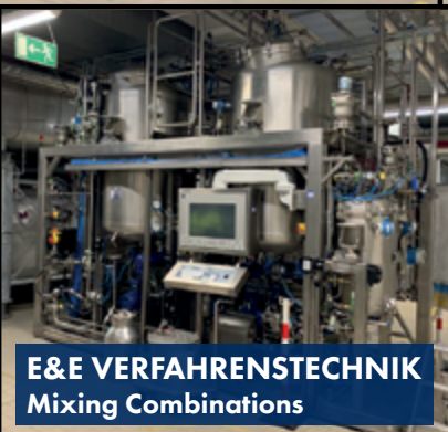
E&E VERFAHRENSTECHNIK Mixing Combinations