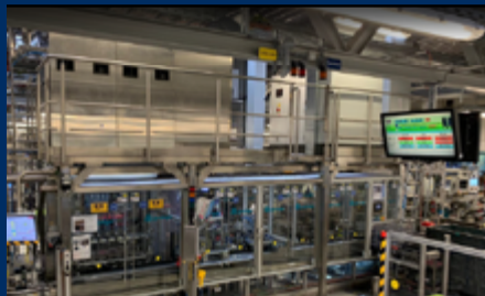
GRONINGER MFCS 202QL High-Speed Bottle Filling Line