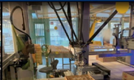
ABB Robotic Double Bottle Loader, Type IRB 360 FlexPicker