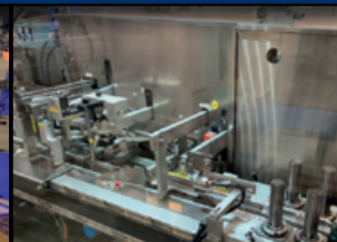
BERGAMI Vertical Cartoners, Type AVS 120