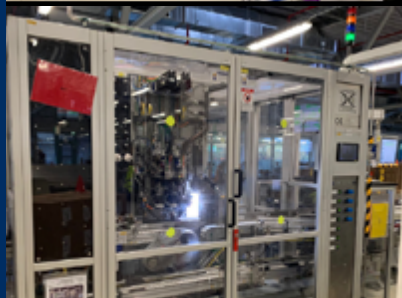
D.CLOOSTERMANS-HUWAERT Screw Capping Press Units