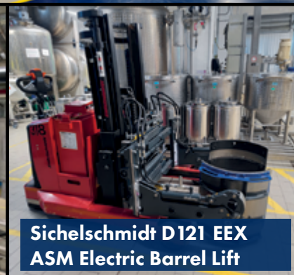
Sichelschmidt D121 EEX ASM Electric Barrel Lift

COMPLETE CLOSURE OF PERFUME MANUFACTURING PLANT FORMERLY USED BY RENOWNED GLOBAL PERFUME & COSMETICS MANUFACTURER COMPLETE FILLING & PACKAGING LINE