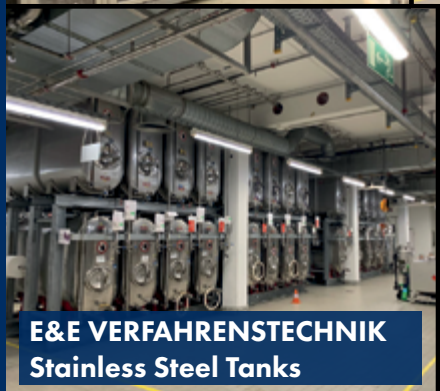
E&E VERFAHRENSTECHNIK Stainless Steel Tanks