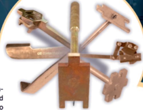
Drum Openers & Cutters

QTi® Non-Sparking Bung Wrenches and Drum Openers are high-quality, high-strength tools made from Copper Titanium alloy. They are used for opening and closing caps and seals of Drums/Barrels containing flammable liquids. There is no need to have different tools for different plug sizes.