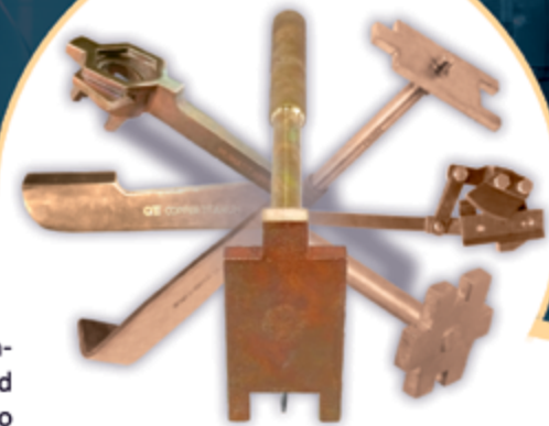
Drum Openers & Cutters

QTi® Non-Sparking Bung Wrenches and Drum Openers are high-quality, high-strength tools made from Copper Titanium alloy. They are used for opening and closing caps and seals of Drums/Barrels containing flammable liquids. There is no need to have different tools for different plug sizes.