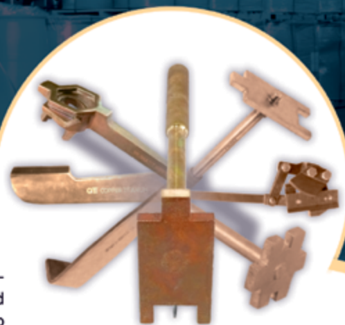
Drum Openers & Cutters

QTI® Non-Sparking Bung Wrenches and Drum Openers are high-quality, high-strength tools made from Copper Titanium alloy. They are used for opening and closing caps and seals of Drums/Barrels containing flammable liquids. There is no need to have different tools for different plug sizes.