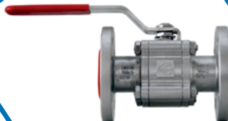
Three Piece Cast Flanged End Ball Valves