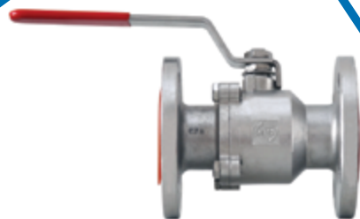
Two Piece Cast Flanged End Ball Valves