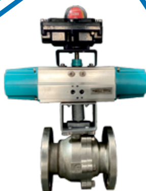
Actuated Ball Valves