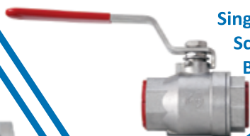
Single Piece Cast Screwed End Ball Valves