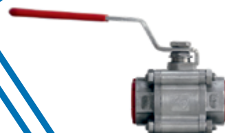
Three Piece Cast Screwed End Ball Valves