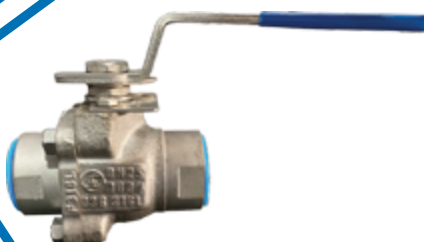
Two Piece Forged Steel Screwed End Ball Valves