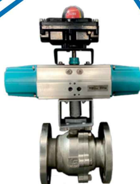
Actuated Ball Valves