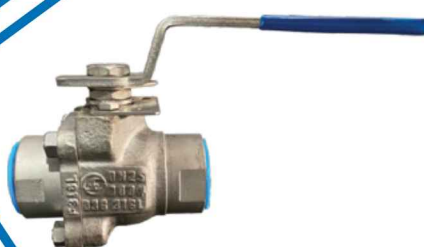
Two Piece Forged Steel Screwed End Ball Valves