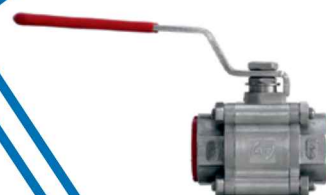
Three Piece Cast Screwed End Ball Valves