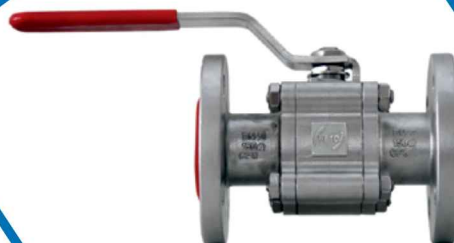
Three Piece Cast Flanged End Ball Valves