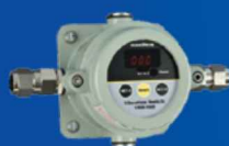
VSW-160 Flame Proof Vibration Switch