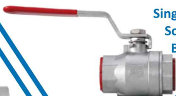
Single Piece Cast Screwed End Ball Valves