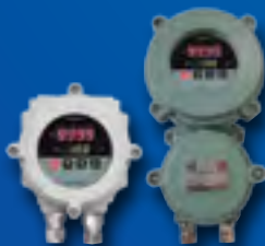
Ex-Proof Auto-Tune Controller LC5296-XP-AT