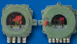
8 Channel Ex-Proof Scanner 8208-XP