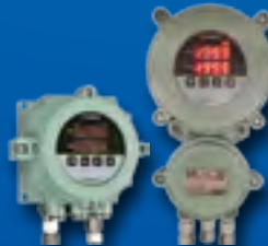
Dual Channel Indicator cum Controller LC5296-XP-DC