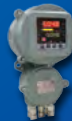
Auto-Tune PID Single Loop Controller 5040-XP