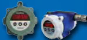
Loop Powered Temperature Transmitter TT7S10-XP