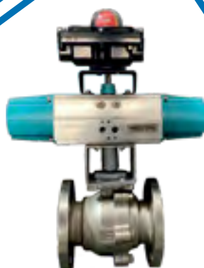
Actuated Ball Valves