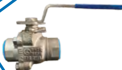
Two Piece Forged Steel Screwed End Ball Valves