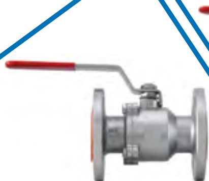
Two Piece Cast Flanged End Ball Valves