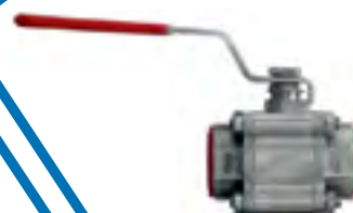
Three Piece Cast Screwed End Ball Valves