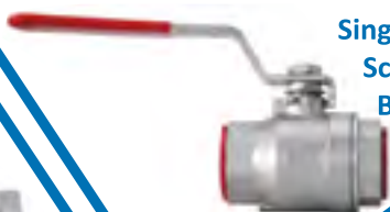
Single Piece Cast Screwed End Ball Valves