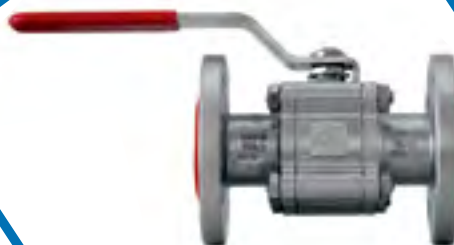
Three Piece Cast Flanged End Ball Valves