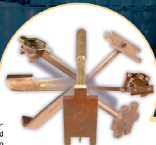
Drum Openers & Cutters

QTi® Non-Sparking Bung Wrenches and Drum Openers are high-quality, high-strength tools made from Copper Titanium alloy. They are used for opening and closing caps and seals of Drums/Barrels containing flammable liquids. There is no need to have different tools for different plug sizes.